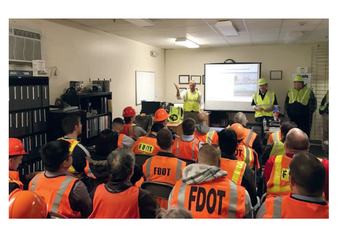
Educating specifiers, design engineers, regulators, elected representatives, contractors, and the public at concrete pipe plants about the applied science of buried rigid and flexible pipelines and culverts

CPI – Concrete Plant International – 5 | 2017 www.cpi-worldwide.com