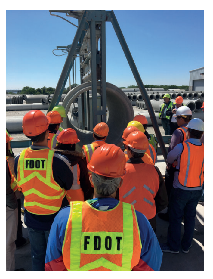
Demonstration of pipe strength with the three-edge bearing (TEB) test

Plant tours demonstrate the performance of concrete pipe through onsite laboratories and testing equipment, such as the load rate used to break compression test cylinders and the three-edge bearing (TEB) test. Visuals go a long way in helping specifiers and design engineers understand strength of concrete pipe. On plant tours, questions can be asked by experienced field inspectors and producers can explain by demonstration.